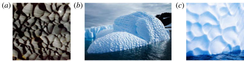
FIGURE 1. Natural patterning. (a) Water-driven mineral scallops. (b) and (c) Water-driven iceberg scallops, exposed by turnover.